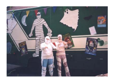
Ross-on-Wye's Mobile Library at the town's Carnival.