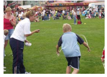
Village races in the main 'Big Event' arena organised by the Active Community Project.