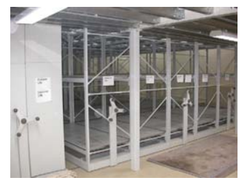
Friar Street-before and after.