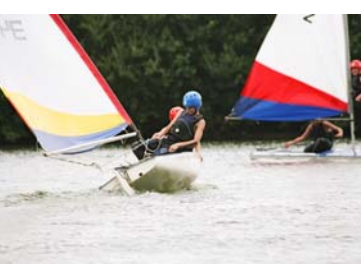
Canoeing and sailing—new groups and activities set up by the Outdoor Education Officer